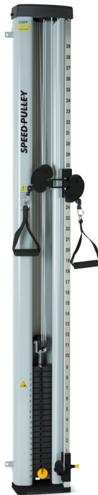
Speed pulley 50kg