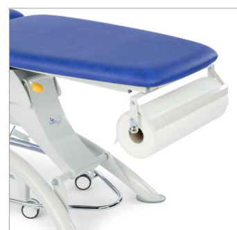
Paper roll holder, castor set, place-free adjustment ring