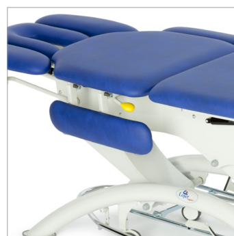
Side supports with fast locking