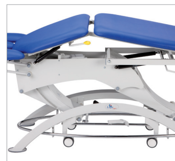
Drainage with gas spring or electric motor